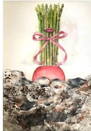
Beth Brooks McCall & Virginia Svetic

EXHIBITION: December 13, 2019 – 5:30pm – 8pm & December 14 & 15, 2019 – 11am – 3pm